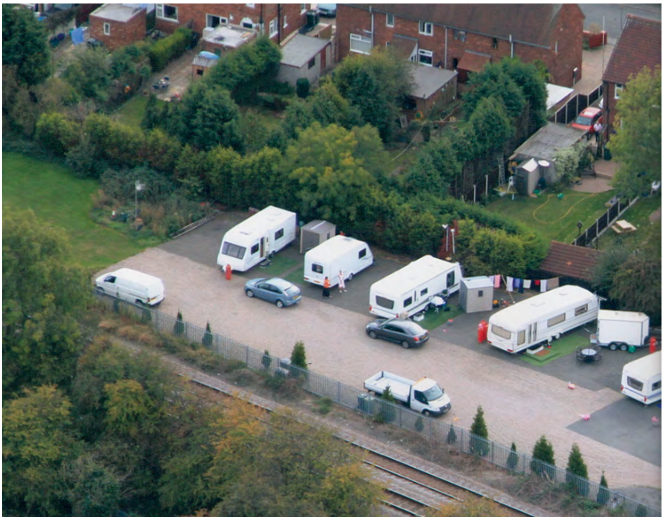
Gypsy family Site