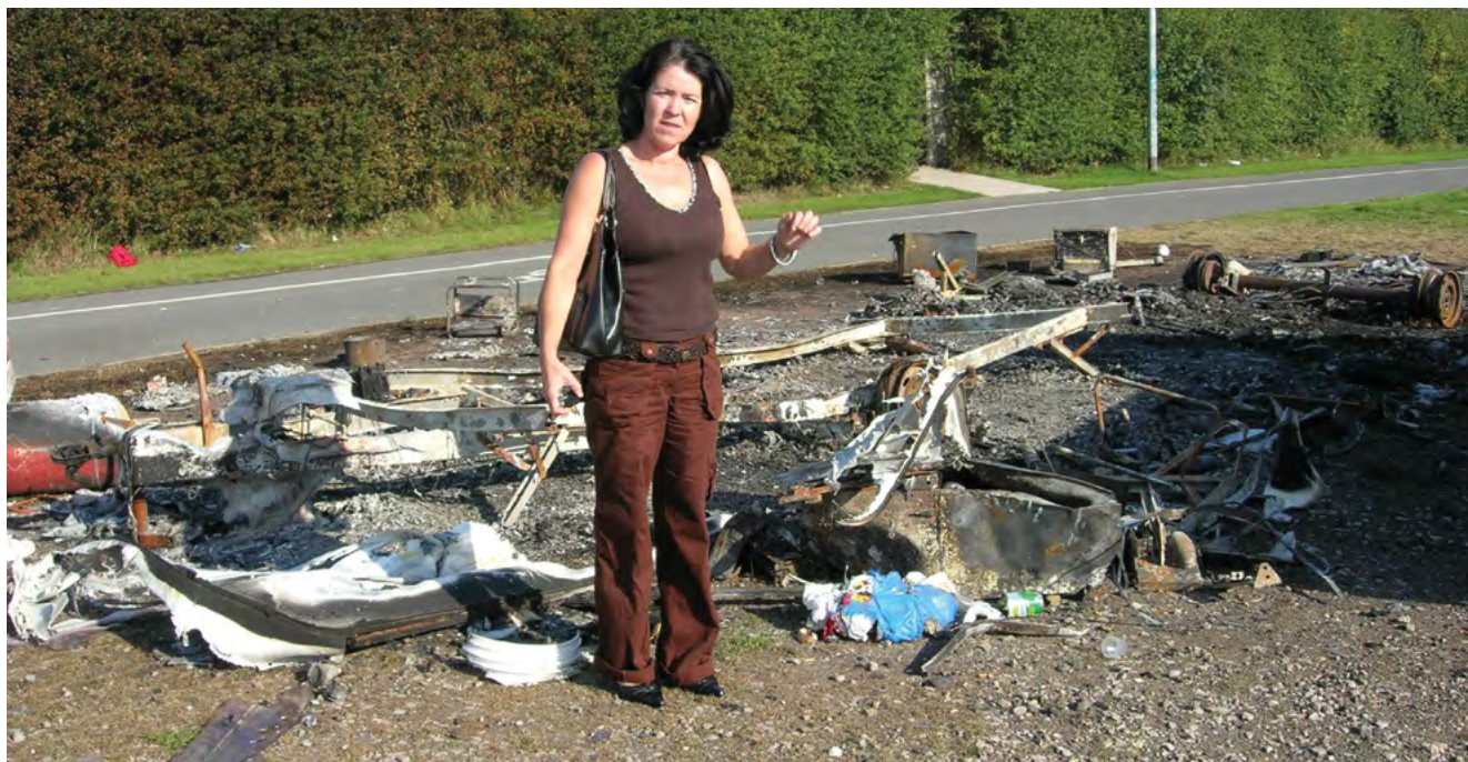
Irish Traveller and burnt out trailer (arson attack)

positive way would be to go down the path of the social media because with Twitter you have a flowing dialogue and somehow that dialogue might help to change attitudes. For example if a woman is abused she has made some opinion and then somebody sent abusive tweets to this woman and thousands of other people come down like a ton of bricks. And it might be that those of the sorts of the dialogues, particularly with the younger generations and those are the ones need to be heard now. If somebody came up with something abusive about Travellers it is continuously and vigorously challenged every time it happens. ‘