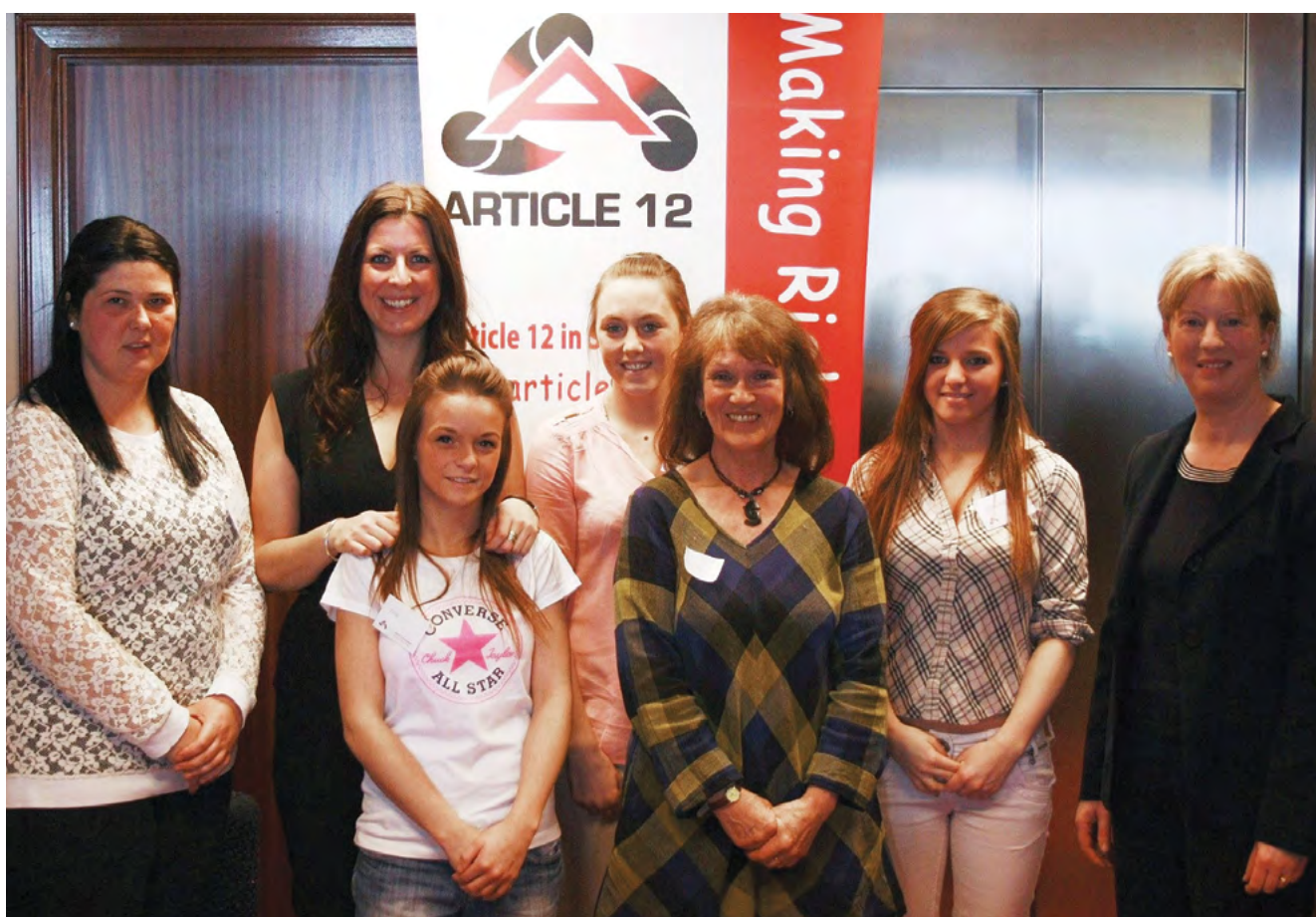
Article 12, Youth Equality Group Scotland

benefits for 'Roma' communities. 11 It is disheartening to read that the European Commission monitoring report on UK 'Roma' Integration (2014) continues to show that a lack of monitoring data means that any progress on 'Roma' integration is difficult to identify. 12 While there have been some small local projects working to improve integration, the Gypsy, Traveller and Roma communities who were consulted for this report, consider that these major streams of EU funding are yet to 'trickle down' into their communities. From the perspective of the community members lived experience, there seems to be little discernable change in the quality of their lives and experiences of social exclusion.