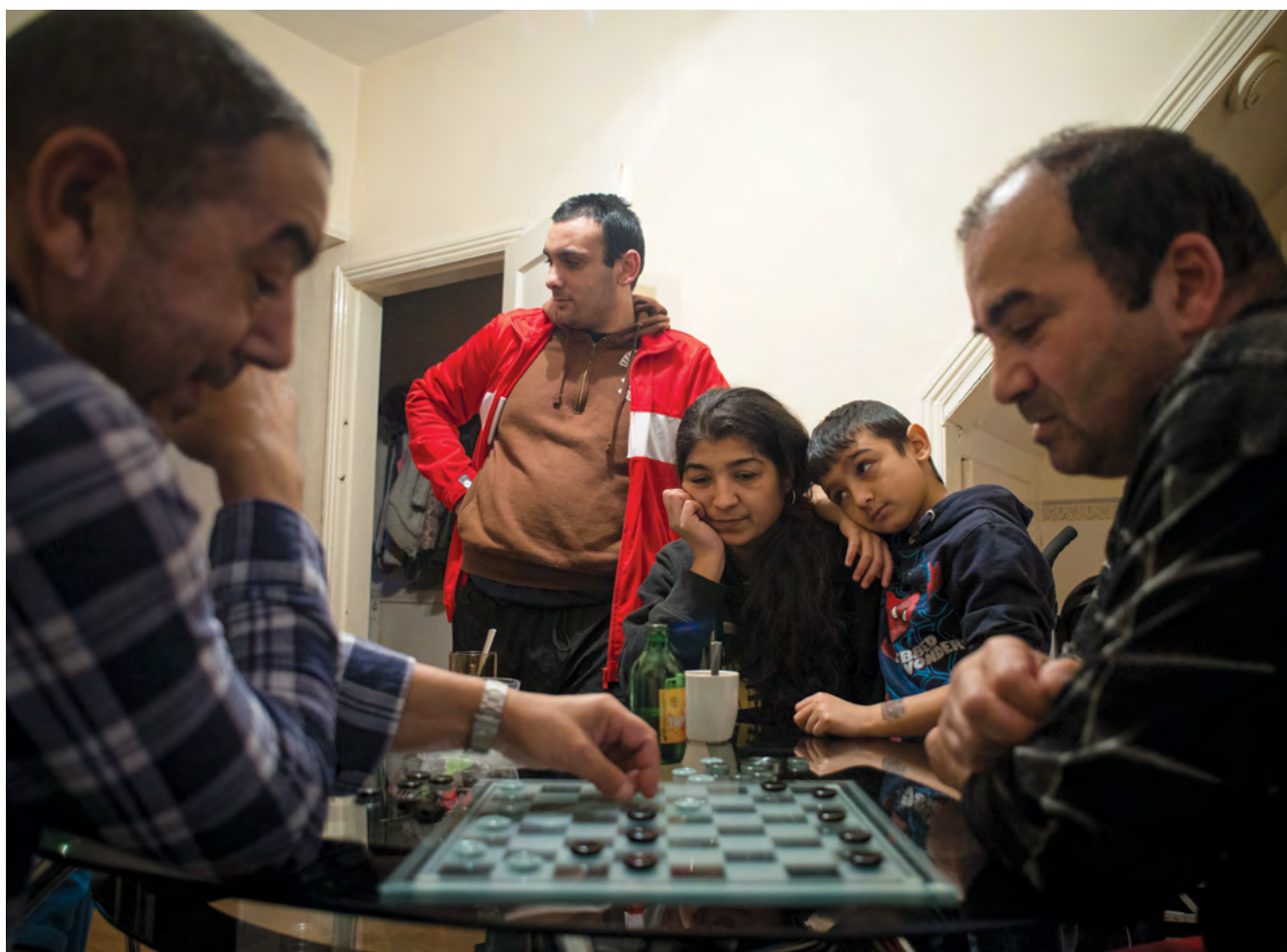
Czech Roma on Teesside

'To close the employment gap between Roma and non-Roma, the EU Framework calls on Member States to ensure Roma non-discriminatory access to the open labour market, self-employment and micro-credit, and vocational training. Member States were encouraged to ensure effective equal access for Roma to mainstream public employment services, alongside targeted and personalised guidance and mediation for Roma jobseekers, and to support the employment of qualified Roma civil servants'. 81