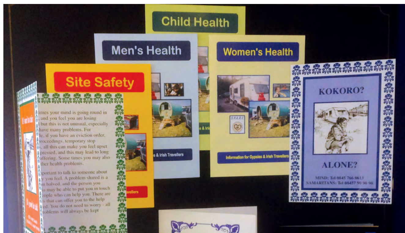
Community groups work to disseminate health information as in this example by Derbyshire Gypsy Liaison Group

To reduce the health gap between the Roma and the rest of the population, the EU Framework calls on Member States to provide access to quality healthcare, especially for children and women, and to preventive care and social services at a similar level and under the same conditions as the rest of the population. The poor health of Roma is very closely linked to social, economic and environmental factors. People in vulnerable situations often have trouble in navigating in the health system and in articulating their needs. 95