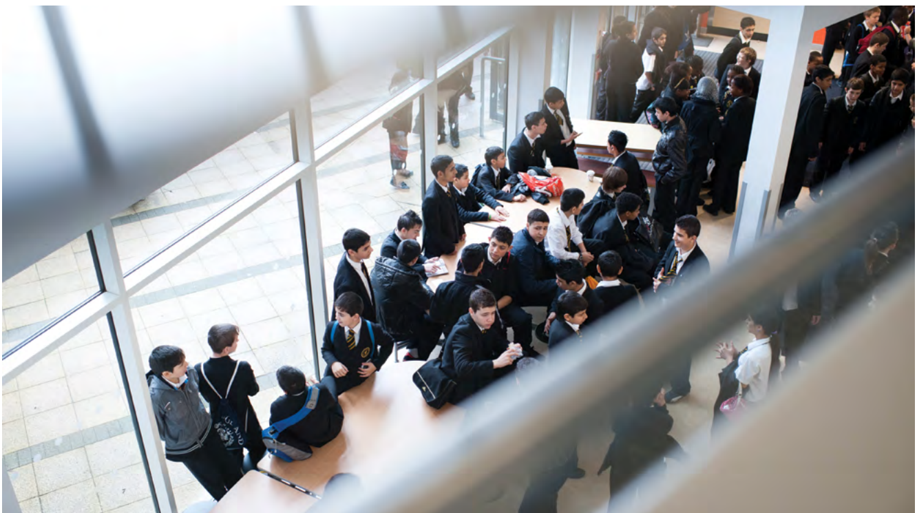
Roma pupils