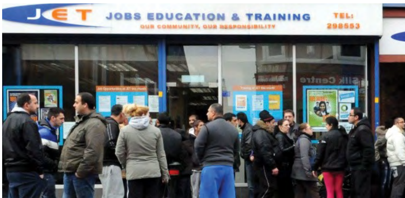
Roma waiting outside employment agency