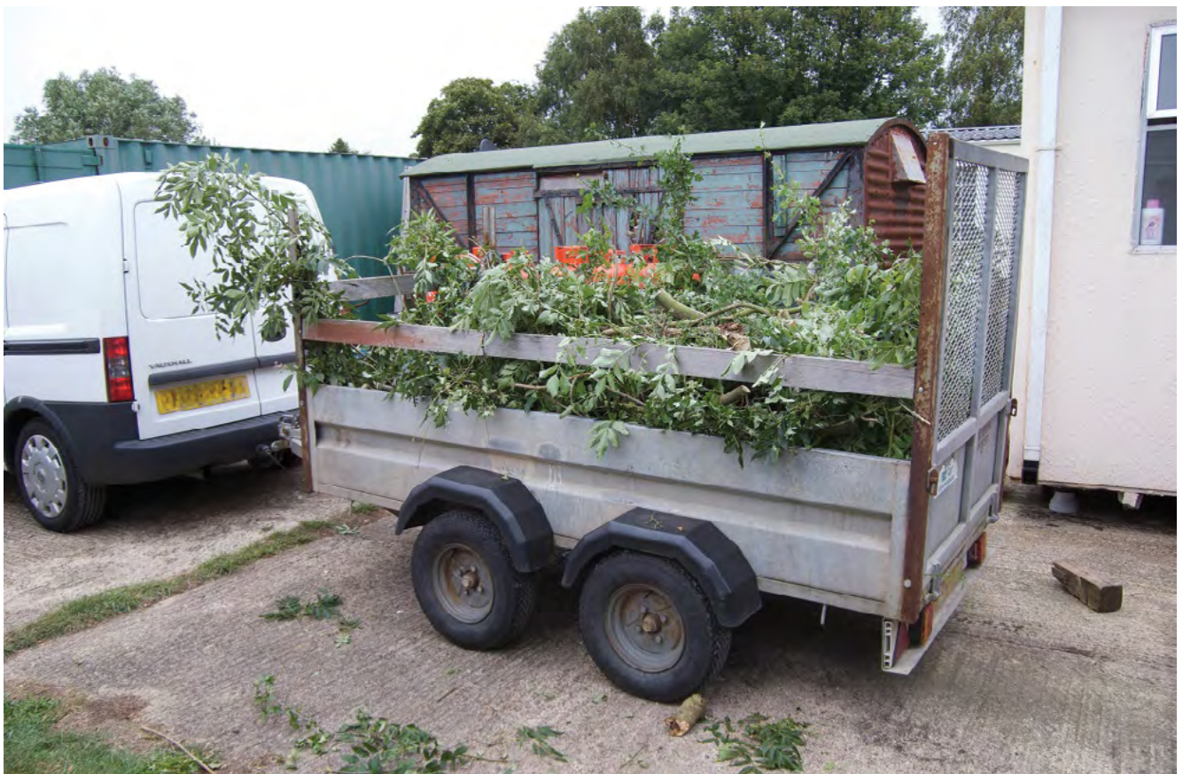
Traditional Gypsy Employment