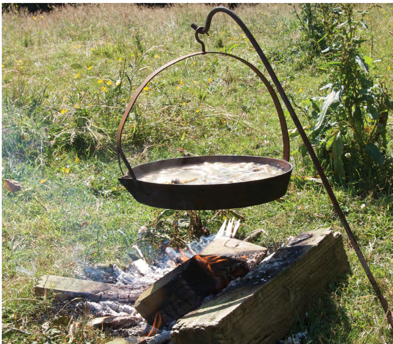
Fire and food a traditional scene for all the communities

Significantly, the EU has used the term 'integration' in all of its 'Roma' integration documentation. Gypsy, Traveller and Roma communities in the UK are clear that they are calling for integration not assimilation into the dominant culture. Community members are seeking equality of rights, opportunities and access to services and to be treated as equal citizens.