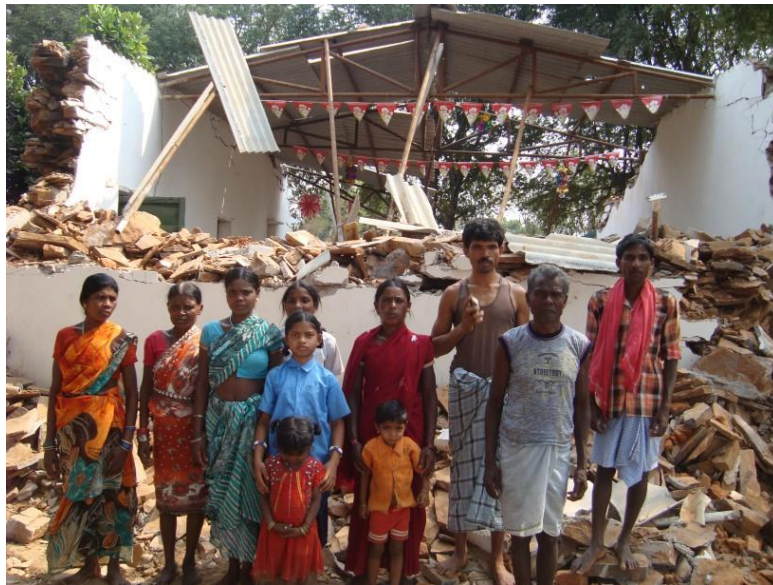
Believers in front of the demolished Church, in Gadiya, Chhattisgarh.

805/92, Deepali Building, Nehru Place, New Delhi - 110019,