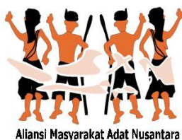
Aliansi Masyarakat Adat Nusantara