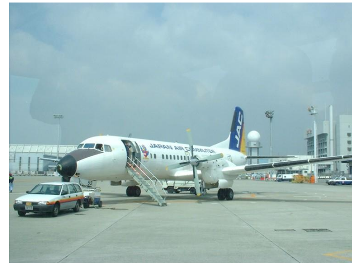
Korean Airlines YS-11 hijacking