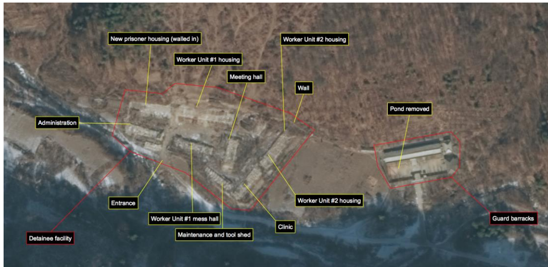
Sorimchon Section of Kwan-li-so No. 15 in 2014 (showing demolition of prisoner residence and work units)