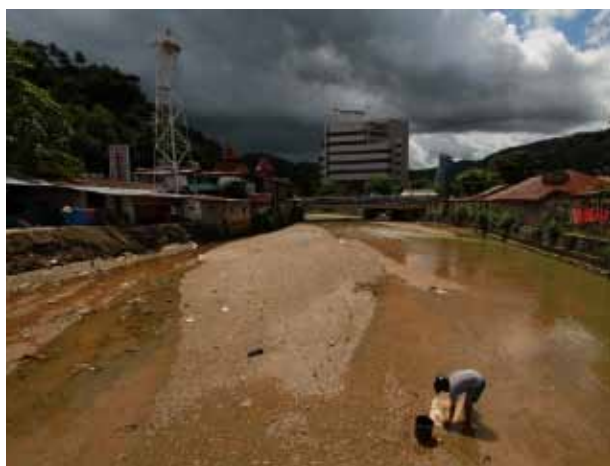
Image 1.1-1: Development is not reaching Papuans

“Papua Land of Peace” is a campaign to bring about a peaceful, rule of law-based situation in Papua, in which the rights of all residents are protected. Human Rights and Peace for Papua, formerly known as the Faith-based Network on West Papua, is the international coalition for Papua (ICP) comprising faith-based and civil society organisations working to promote human rights and a peaceful solution to the conflict in Papua. Since 2003, this coalition has supported the “Papua Land of Peace” campaign.