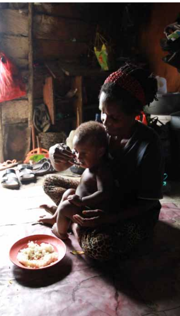
Image 6.4 – 1: After 12 years of Special Autonomy, poverty continues to affect the majority of Papuans

in the region. Furthermore, there is a lack of support and co-ordination between the Governor's Office, the Papuan People's Council (MRP) and the Papuan People's Representative Council (DPRP). The administration operates without a clear policy direction. These three institutions' understanding of Special Autonomy is still stuck in the context of funding issues and community-development orientation regarding economy, health, and education, whereas the Special Autonomy should also focus on the issue of human rights. 21