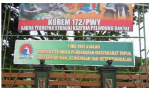
Image 5-1: Derogatory TNI Banner displayed to the public at an Abepura military base: "May 1st 1963 is a milestone in history when Papua was liberated from stupidity, poverty and backwardness"

A number of policies, which are a legacy of the New Order regime before 1998 and which have proven unsuccessful in solving Papua conflict, remain in place. In addition to ignoring the roots of the conflict, the government continues to use the security approach which places the military (TNI) at the front line, with the pretext of fighting separatism in Papua. This fact can be seen by the large-scale deployment of military forces, as well as the range and number of military operations. 1 The issue of security is not the only problem in Papua. The roots of the conflict are complex and include historical, political, economic and culture elements which are intertwined and will not be successfully resolved through an approach that is solely focussed on a military solution.