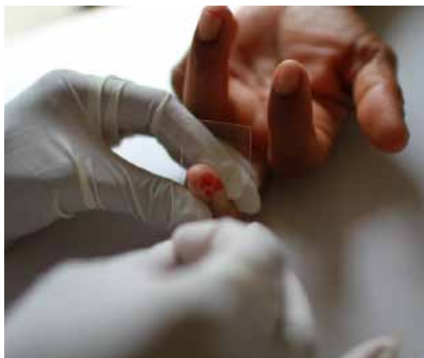
Image 3.1-2: Tests for HIV/AIDS are not yet available in all areas