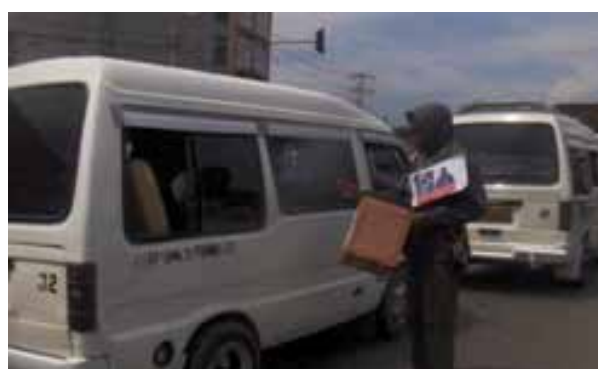
Image 2.2-1: One of the human rights defenders collecting donations for political prisoners