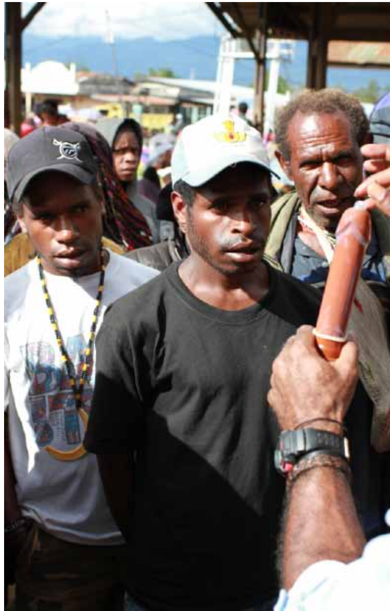
Image 3.1-3: Contraception being introduced to Papuan communities

The right to health obliges States to provide core-obligations in regard to health services, such as non-discrimination and the provision of essential medicines. Besides that, States must indicate how they make progress according to the available resources in advancing health and care, including indigenous people's health. The resources for healthcare provision are considerable, but despite the considerable availability of funds, an improvement of the health care system over the past two years is not noticeable. The same conclusion was already visible in the Human Rights in West Papua report in 2011.