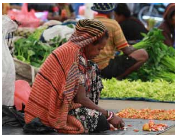
Image 6.3-1: While Non-Papuans are running shops, Papuan women often have no other option for income than selling vegetables at the market

From reports on developments in the various regencies we can conclude that the quality and availability of health and education services are far from satisfactory and do not meet Papuans’ needs. Despite the negative consequences created by a lack of civil administration policies, the central government appears to be allowing this situation to continue, including the dominance by the security forces.